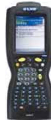
MX5 Windows CE .NET