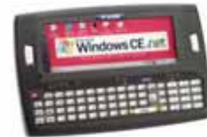
MX3X Windows CE.NET