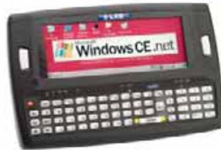
MX3X Windows CE.NET