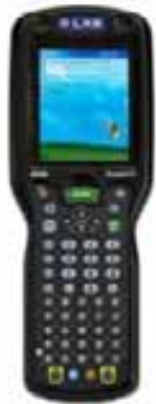
MX6 Win Mobile 2003