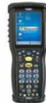
MX7 Windows CE .NET