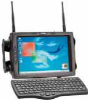
VX5 Windows XP