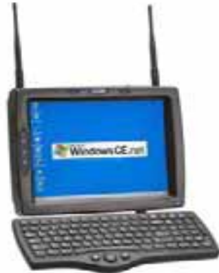
VX7 Windows CE .NET