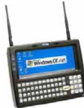
VX6 Windows CE .NET